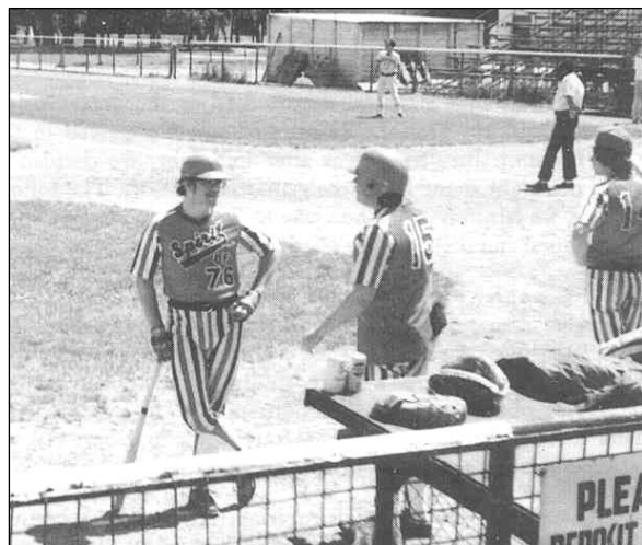
Figure 2. Spirit of '76, pictured in 1977 in an away game against the Wiesbaden Eagles, defending US Army European champions.